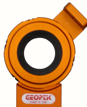
Variable connexion tube 7,4-9,5 mm #30A189B